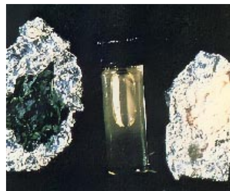
PCP in both crystalline form and a vial of PCP dissolved in water

PCP is a clandestinely manufactured hallucinogen. The chemicals required to manufacture the drug are readily available and inexpensive. Moreover, the production process is relatively simple and requires very little laboratory equipment. Manufacture of the drug primarily remains under the control of Los Angeles-based street gangs.