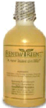
Blue Nitro and Renewrient, liquid and pill form, have been removed from the market.