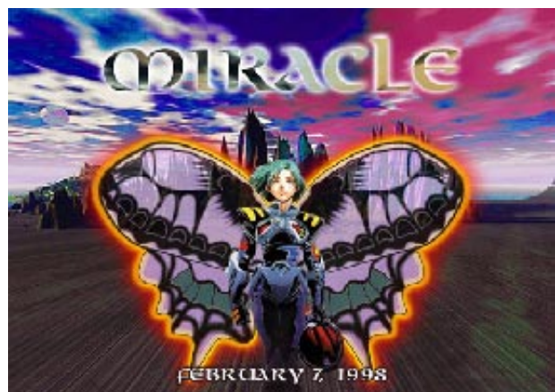
Rave advertisements from various Internet sites.