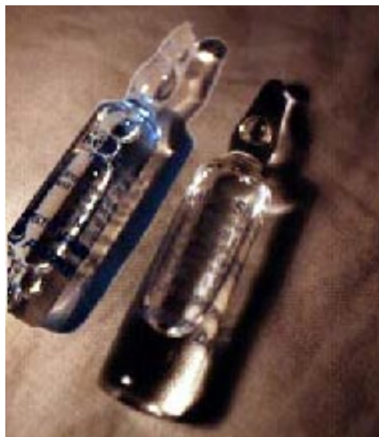
Liquid Ketamine in its original pharmaceutical packaging

Marketed as a dissociative general anesthetic for human and veterinary use, the only known source of ketamine is diverted pharmaceutical products. Recent press reports indicate a significant number of veterinary clinics are being robbed specifically for their ketamine stock. Ketamine liquid can be injected, applied to smokable material, or consumed in drinks. The powdered form is made by allowing the solvent to evaporate, leaving a white or slightly off-white powder that, once pulverized, looks very similar to cocaine. The powder can be put into drinks, smoked, or injected. Prices average $20 per dosage unit.