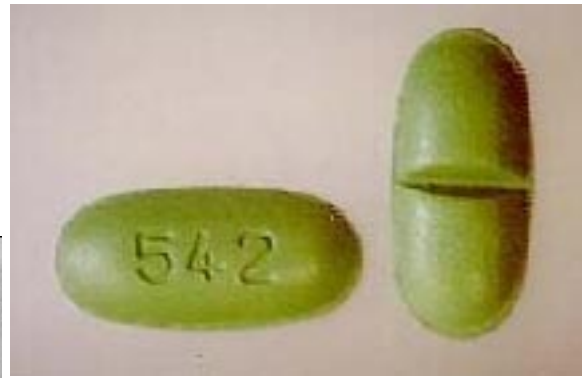
(Left) The original Rohypnol pills and packaging. (Above) The new Rohypnol tablet which includes a dye that would make the drug visible if slipped into a drink.

Rohypnol is marketed by Hoffman - La Roche Inc., and is legally sold in Latin America and Europe as a short-term treatment for insomnia, and as a preanesthetic medication. One of the significant effects of the drug is anterograde amnesia, a factor that strongly contributed to its inclusion in the Drug-Induced Rape Prevention and Punishment Act of 1996. It is available as a .5-milligram and 1-milligram oblong tablet, as well as a 1-milligram per milliliter injectable solution. Roche Pharmaceuticals phased out the 2-milligram dose tablet from 1996 to 1997, and is phasing out the round, white 1-milligram tablet. The licit market for the drug is currently supplied with a 1-milligram dose in an olive green, oblong tablet, imprinted with the number 542. The new tablet includes a dye which, according to Hoffman - La Roche, will be visible if it is slipped into a drink.