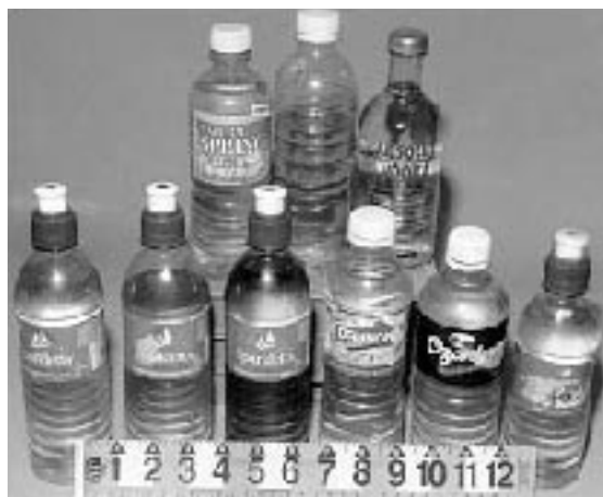
Highly soluble GHB is often added to spring water or concealed in mouthwash bottles.

Internet recipes warn prospective chemists to closely monitor the pH level of the solution. Several companies advertise kits for sale over the Internet that provide the customer with GBL, sodium hydroxide, and litmus paper. Since the drug is easy to synthesize and manufacture, distribution is handled by local operators.