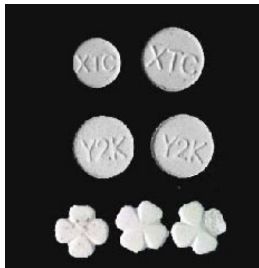
MDMA tablets in various forms

Primarily illicitly manufactured in and trafficked from Europe, MDMA is the most popular of the club drugs. DEA reporting indicates widespread abuse of this drug within virtually every city in the United States. Although it is primarily abused in urban settings, abuse of this substance also has been noted in rural communities. Prices in the United States generally range from $20 to $30 per dosage unit; however, prices as high as $50 per dosage unit have been reported in Miami.