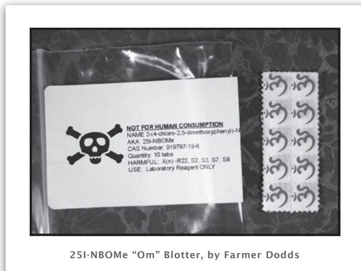
25I-NBOMe "Om" Blotter, by Farmer Dodds

A great deal of 25I and 25C are sold to end-users as pure powder, which creates an inherently dangerous situation. Most people (especially 16-25-year-old experimenters) don't know the safety procedures necessary for handling super-potent compounds. Weighing and