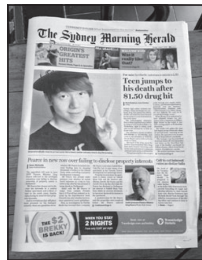
Sydney Newspaper, by Mark Pesce

One detectable difference between LSD and the NBOMe compounds when found on blotter is taste. Genuine LSD blotter is either tasteless or has a mild “metallic” flavor, while most people describe an intense bitterness when holding 25I or 25C blotter in their mouth. This is likely due to a hit/tab containing five to ten times more chemical. The bitter taste has led some distributors to add mint or fruit flavoring to NBOMe liquid and blotter.